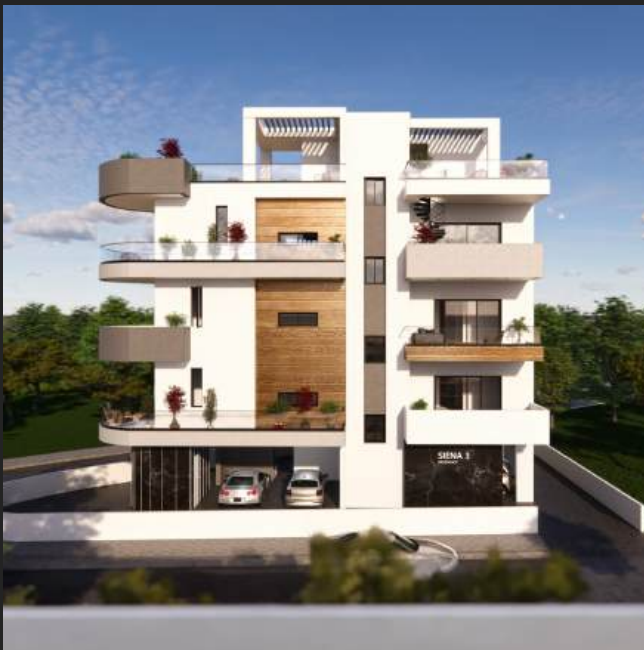
SIENA RESIDENCE 3