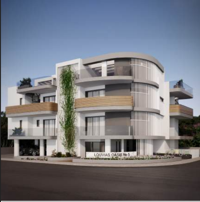
LOUVIAS OASIS NO.5