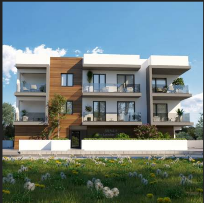
SIENA RESIDENCE 6