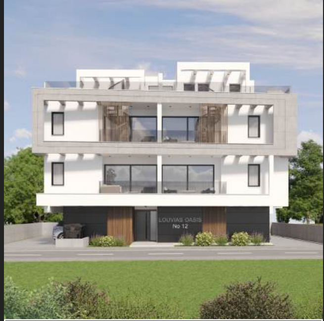
LOUVIAS OASIS NO.12